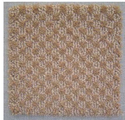
Small texture effects...