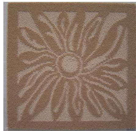
Combine shapes and textures...