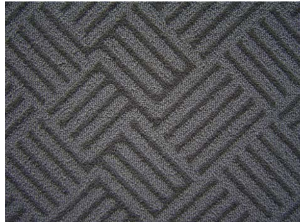
Very clean tufting even before shearing

Tufted at 14 mm Cut Pile, 12 mm finished Pile Height Level Cut Loop