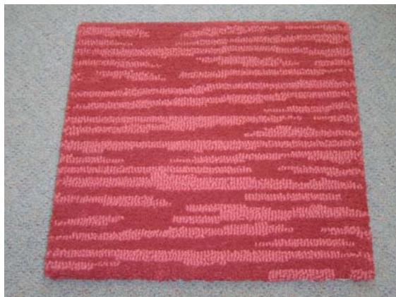
In subtle or bold colors...