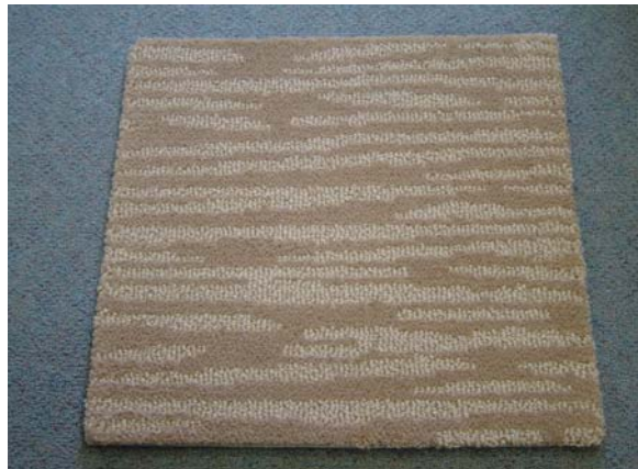
Large texture effects...