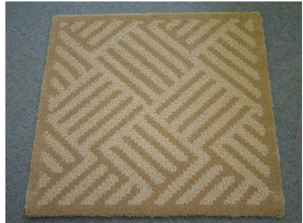
Regular geometric patterns...

Exploit the differences of cut and loop pile with AutoTuft - robotic tufting machine