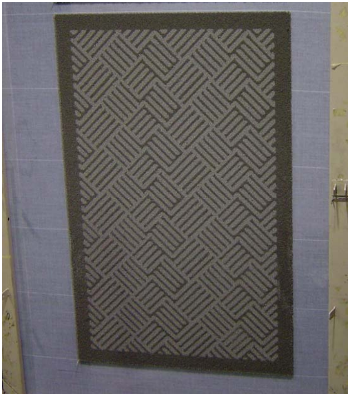
Actual 5'x8' rug as tufted on the machine